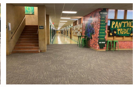
Parcells MS New Lobby Carpet