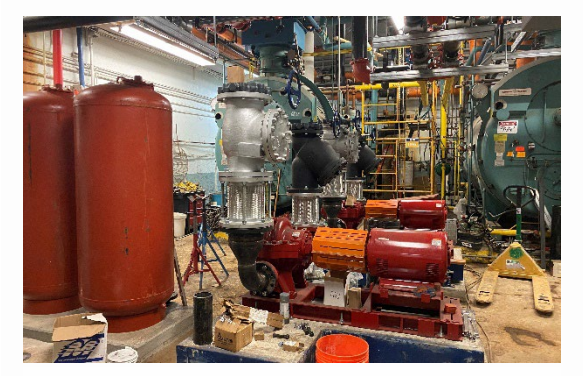
GP South Mechanical Equipment Install