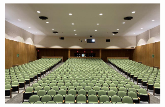
Parcells MS Renovated Auditorium