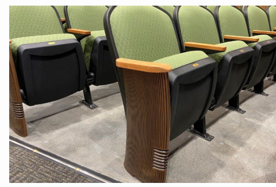
Parcells MS New Auditorium Seating