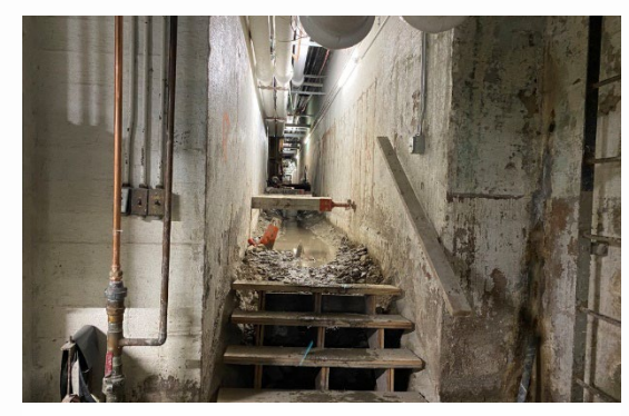
GP South Tunnel Repairs