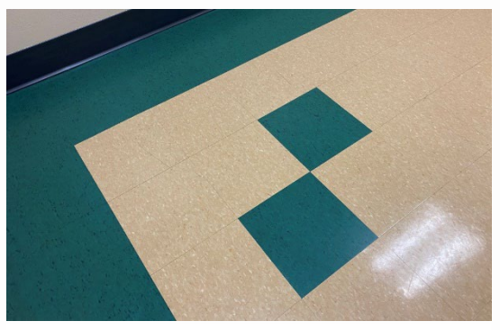
Parcells MS New Floor Tile