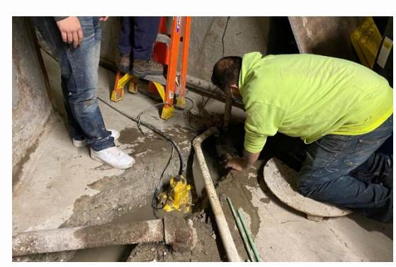
GP South Tunnel Repairs