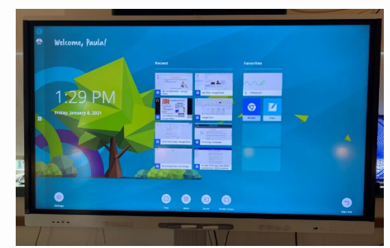
Mobile A/V Monitor