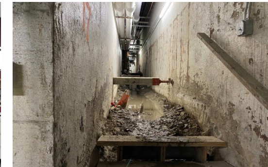
GP South Tunnel Repairs