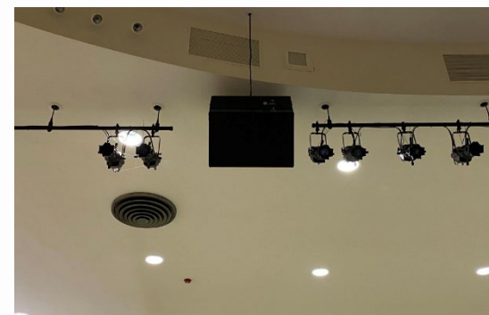
Parcells MS New Auditorium Speakers/Lighting