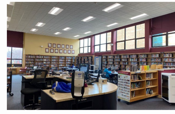
Parcells MS Renovated Library