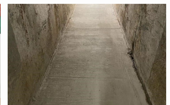
GP South Tunnel Repairs