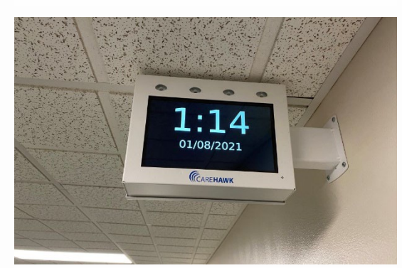
New Corridor Clock/Alert System