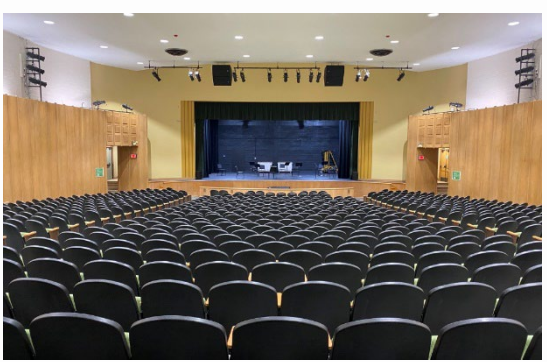
Parcells MS Renovated Auditorium