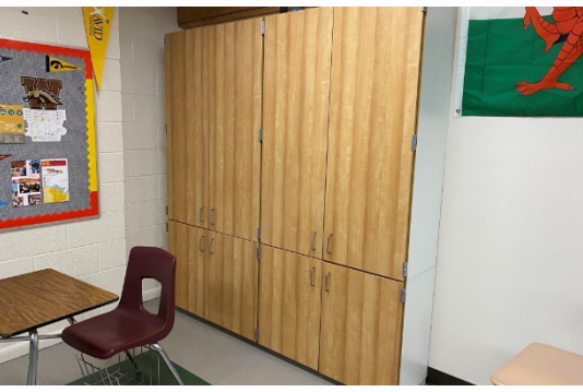
Parcells MS New Classroom Storage